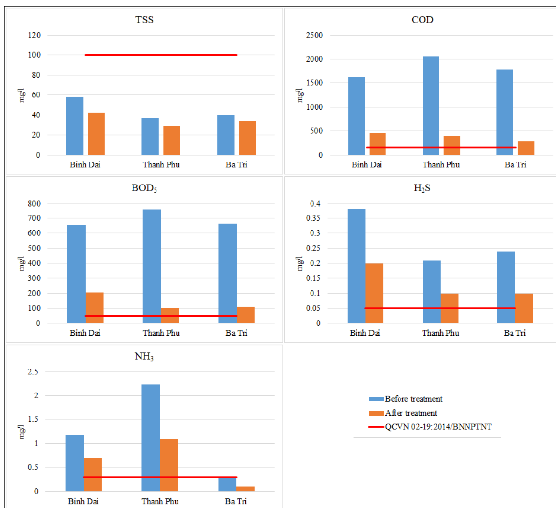
Figure 2. TSS, COD, BOD 5 , H 2 S, NH 3 concentrations in three districts before and after treatment.

*: Characteristics of effluent from intensive shrimp ponds of 30 households in 3 districts were sampled and analyzed