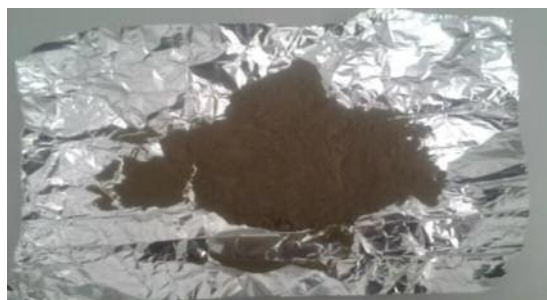
Fig. 2. Pre-treated sediment sample